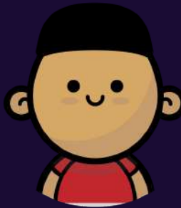
Nhlanhla Ramonotsi Photo Video Lead Designer